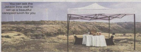
You can ask the Jakson Inns staff to set up a beautiful canopied lunch for you

In and around Pull apart the drapes in your room to see acres of farmland and lawns in the distance. My room also had a gorgeous view of the pomegranate trees. Every room is equipped with basic amenities boxed up neatly on a tray in the bath area. An English newspaper and the 'medium-soft' pillows that I mentioned in my preference sheet during my reservation were delivered to my room when arrived—I was ecstatic to see homemade chocolates lined up when I